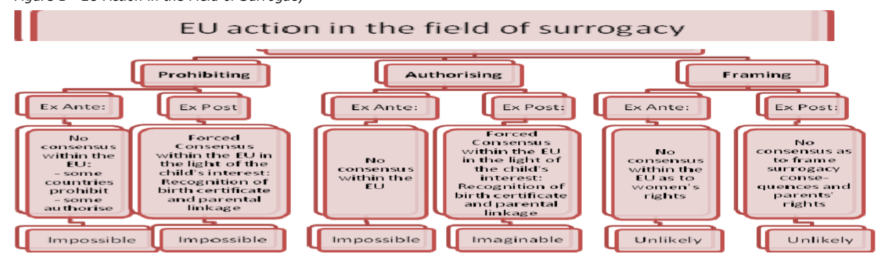
Figure 1 - EU Action in the Field of Surrogacy